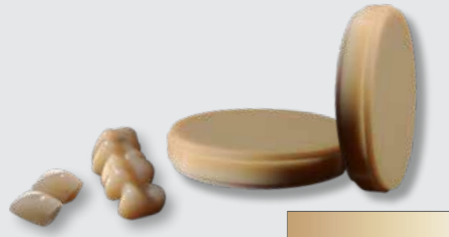
The multi-colored disc consists of five color shades with gentle color transitions that provide a natural look